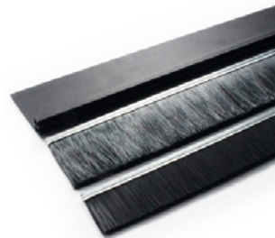
Extended 3" x 60" Brush Grommet Part No. 10097