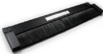
Extended 6" x 24" Brush Grommet Part No. 10013