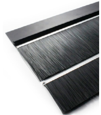
Extended 6" x 60" Brush Grommet Part No. 10098