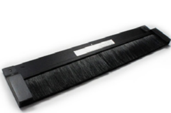
Extended 3" x 24" Brush Grommet Part No. 10012